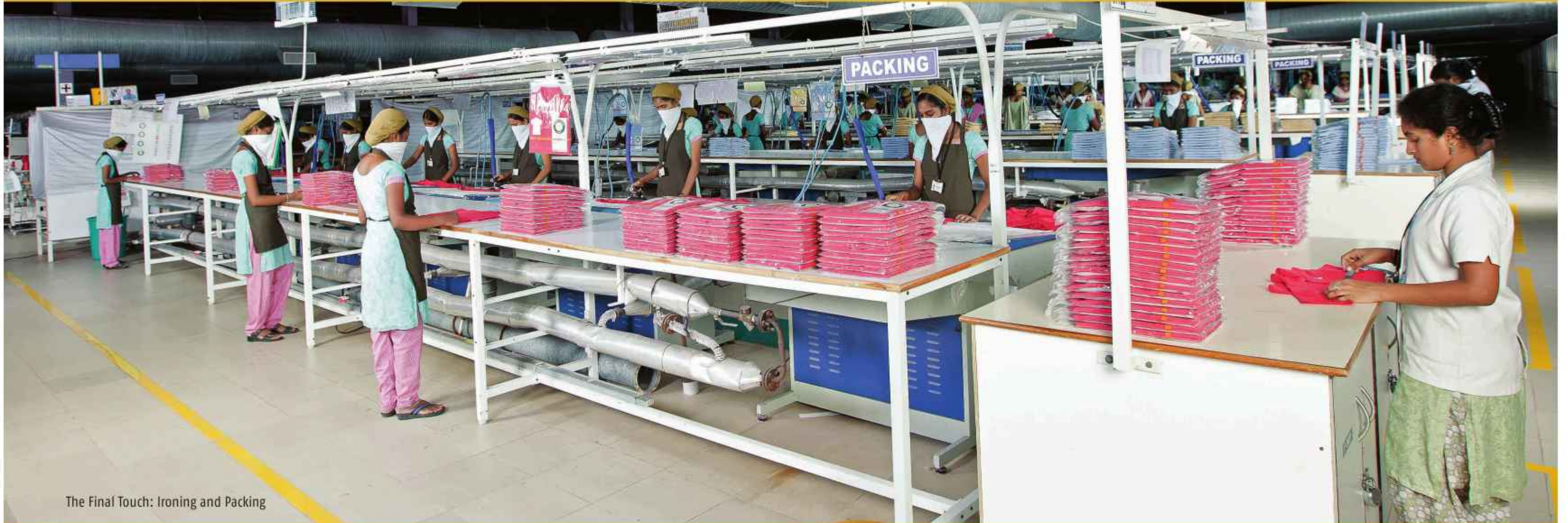
The Final Touch: Ironing and Packing