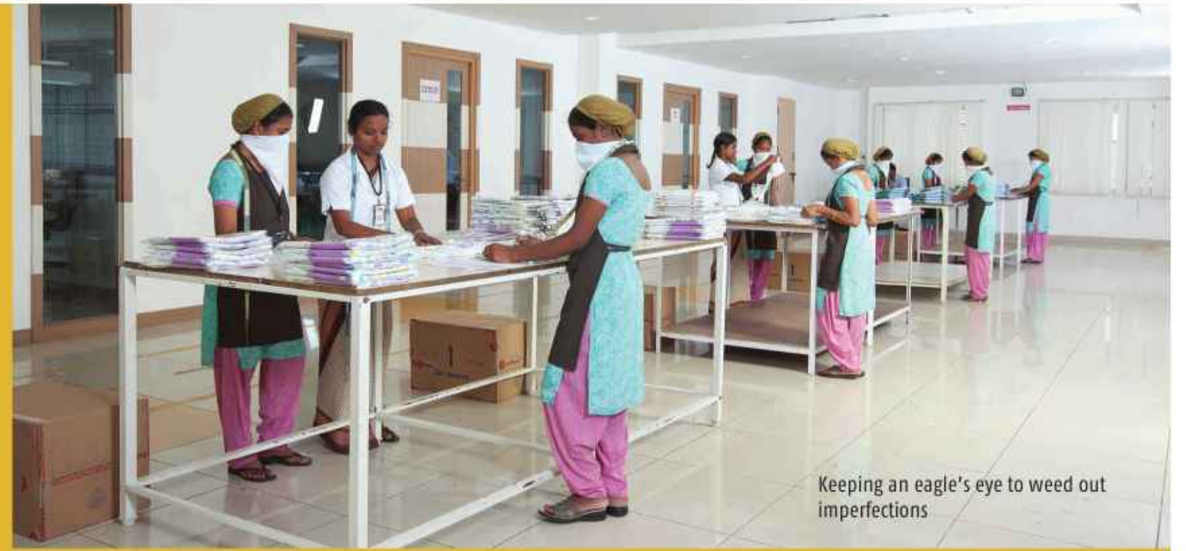
Keeping an eagle's eye to weed out imperfections