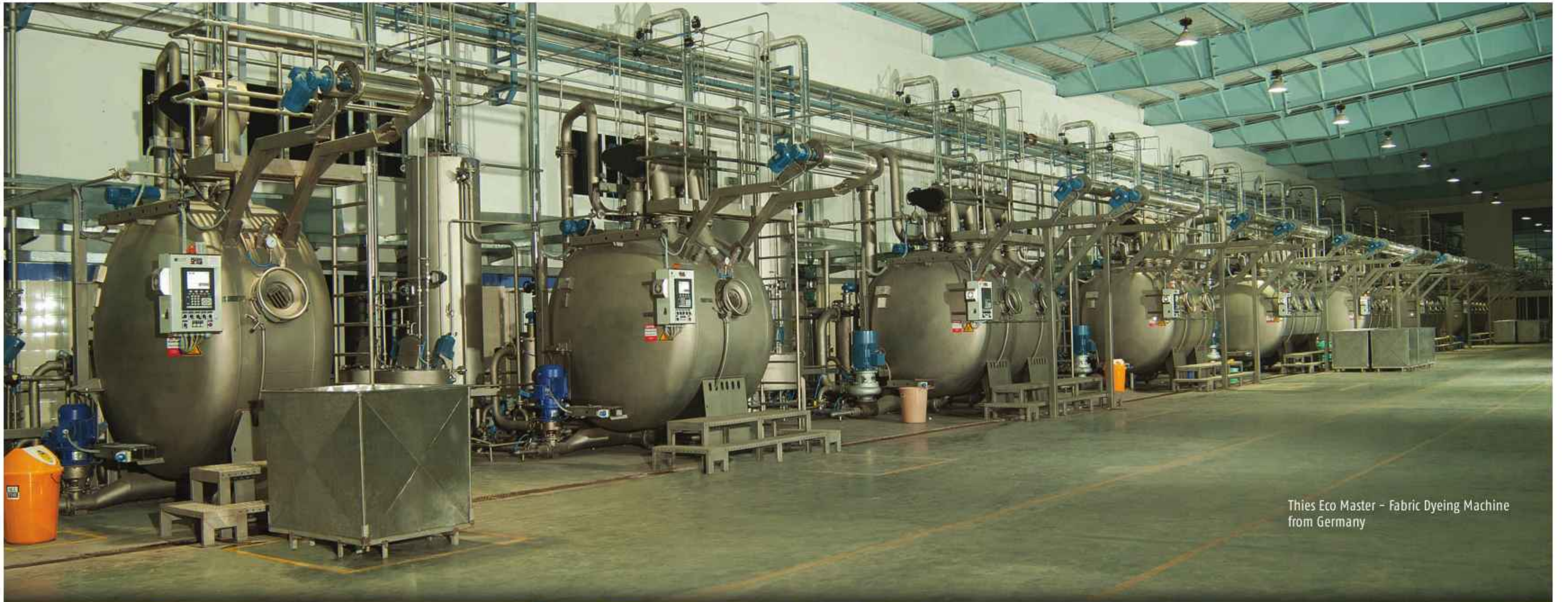
Thies Eco Master - Fabric Dyeing Machine from Germany