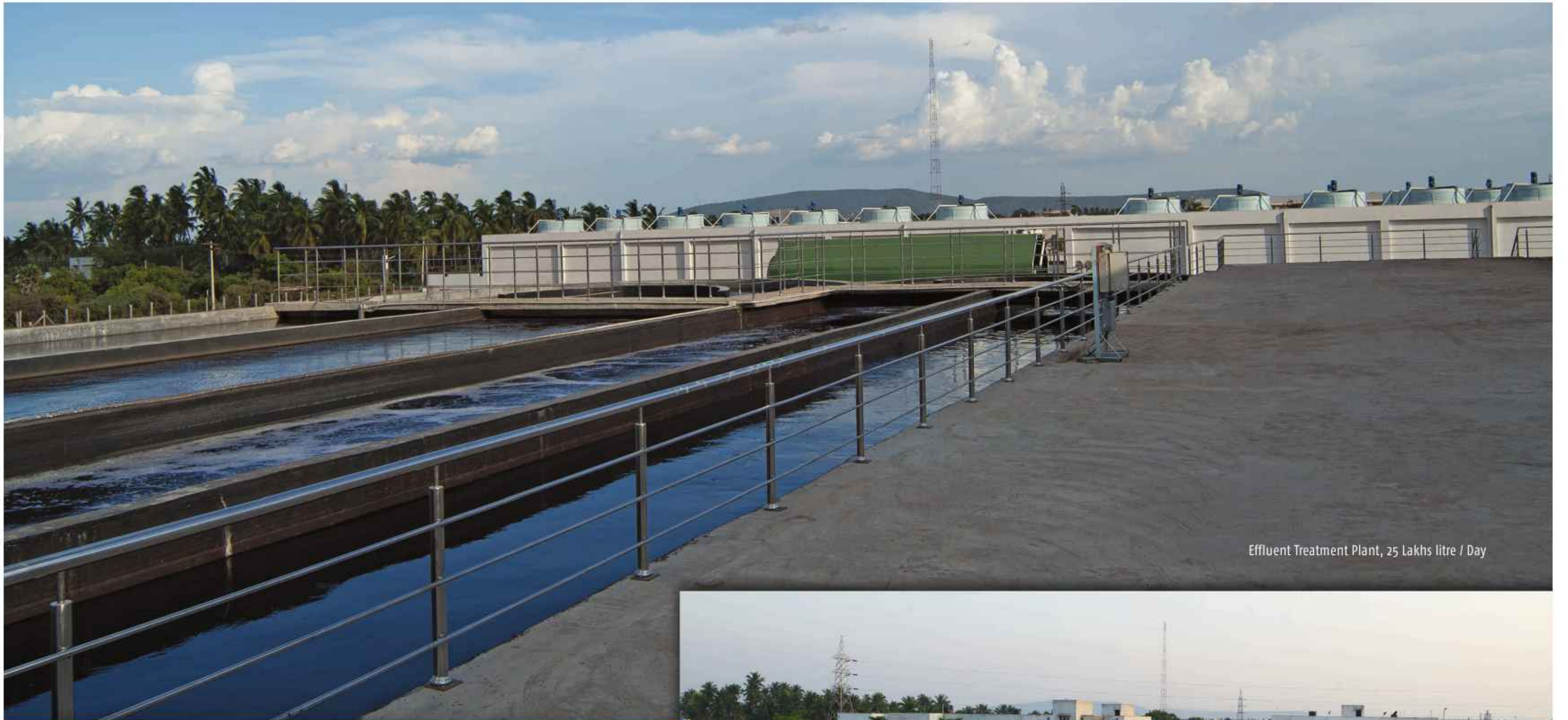
Effluent Treatment Plant, 25 Lakhs litre / Day