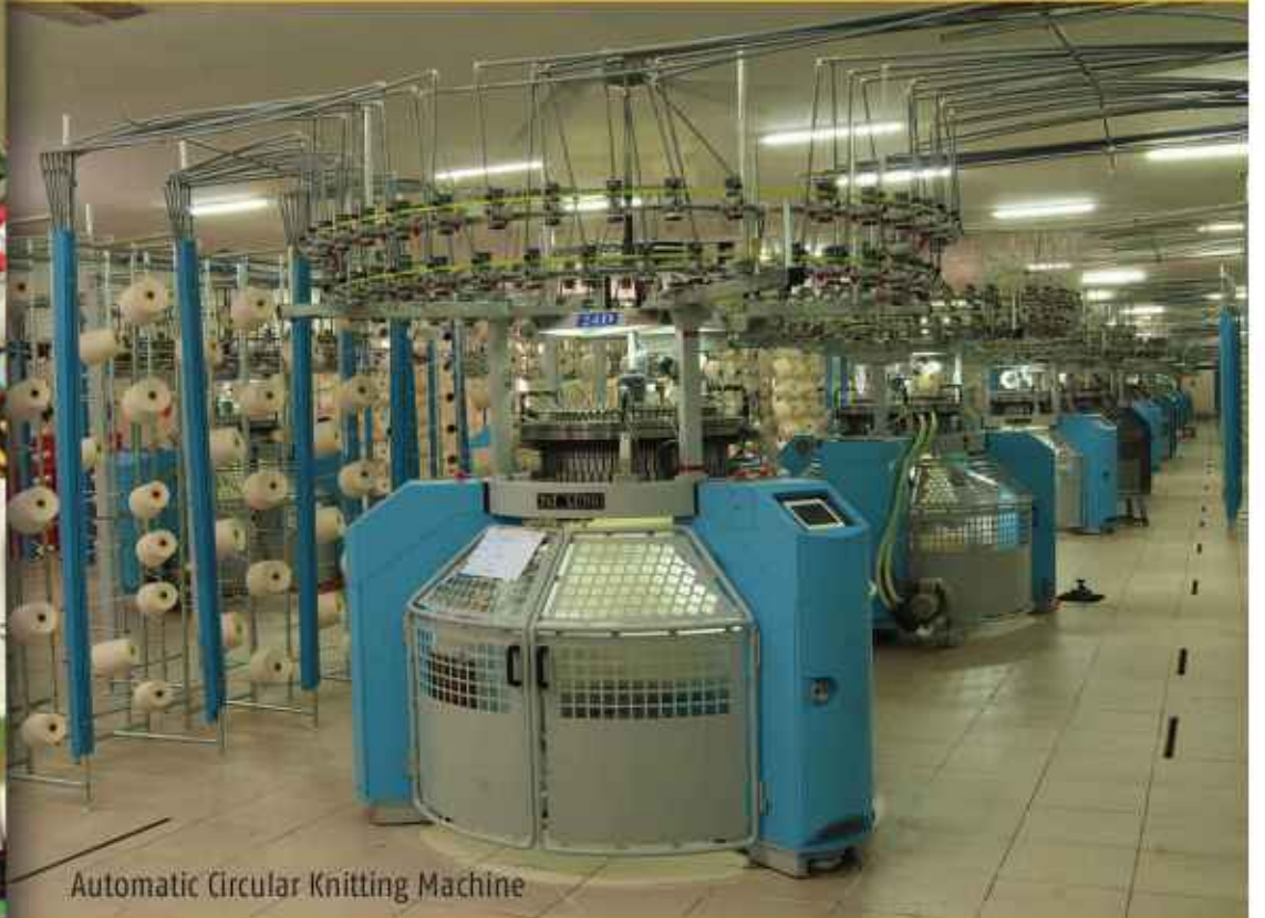
Automatic Circular Knitting Machine

KPR's knits are tested, trusted and truly desired. Our knitting division in Arasur and Neelambur (near Coimbatore, India) is equipped with high speed automatic circular knitting machines with a capacity to manufacture 21000 MT of fabrics per annum.