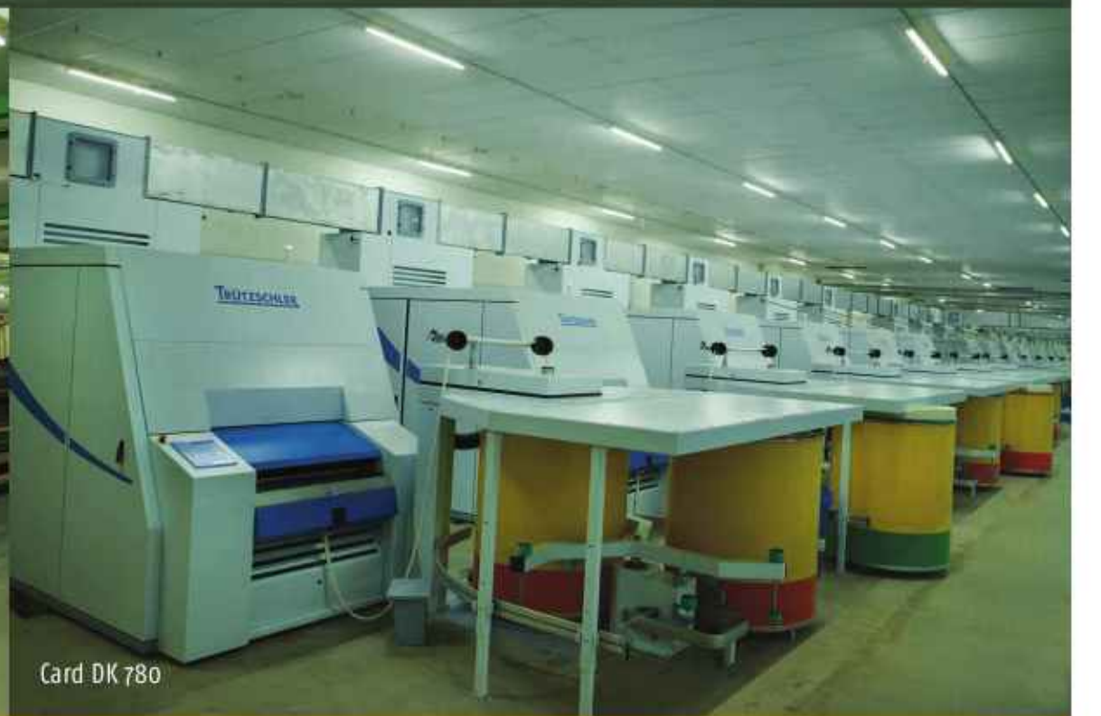
Card DK 780