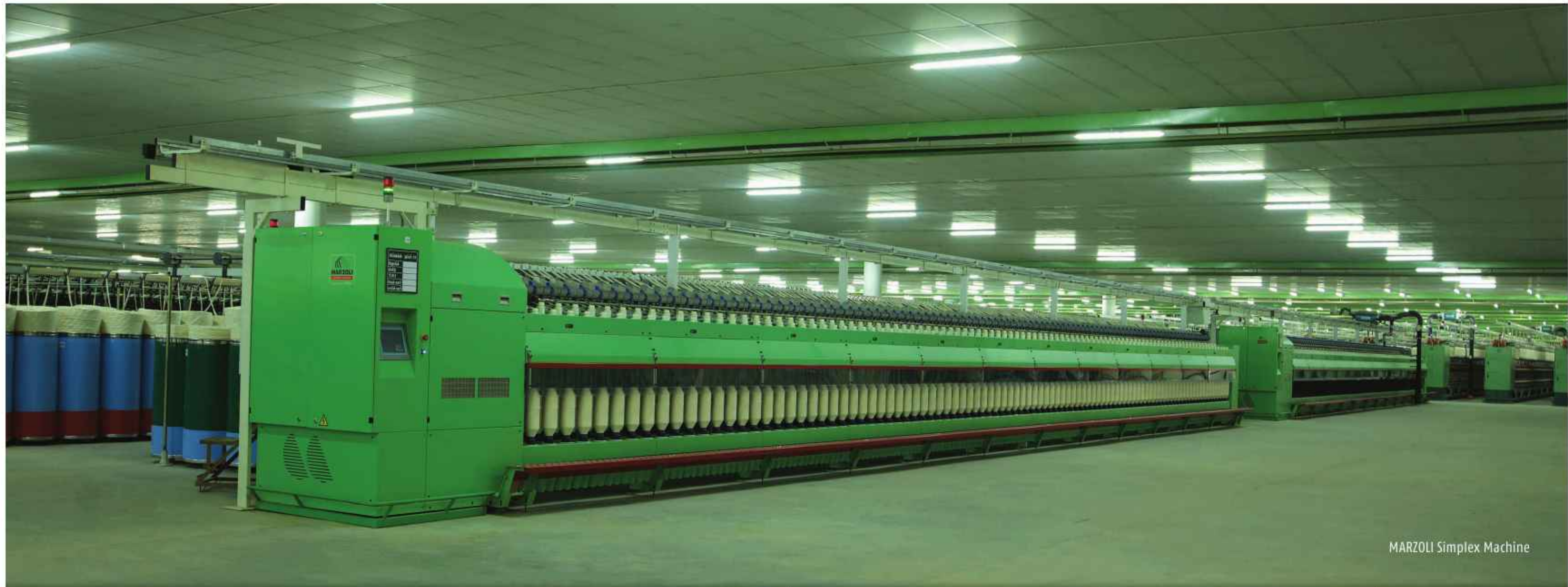
MARZOLI Simplex Machine