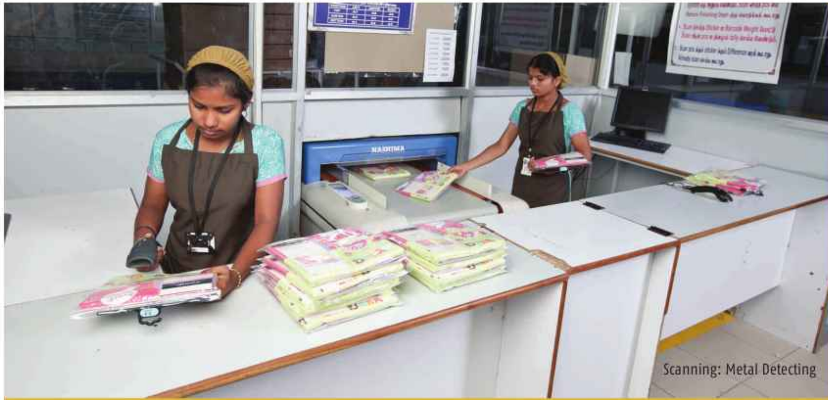
Scanning: Metal Detecting