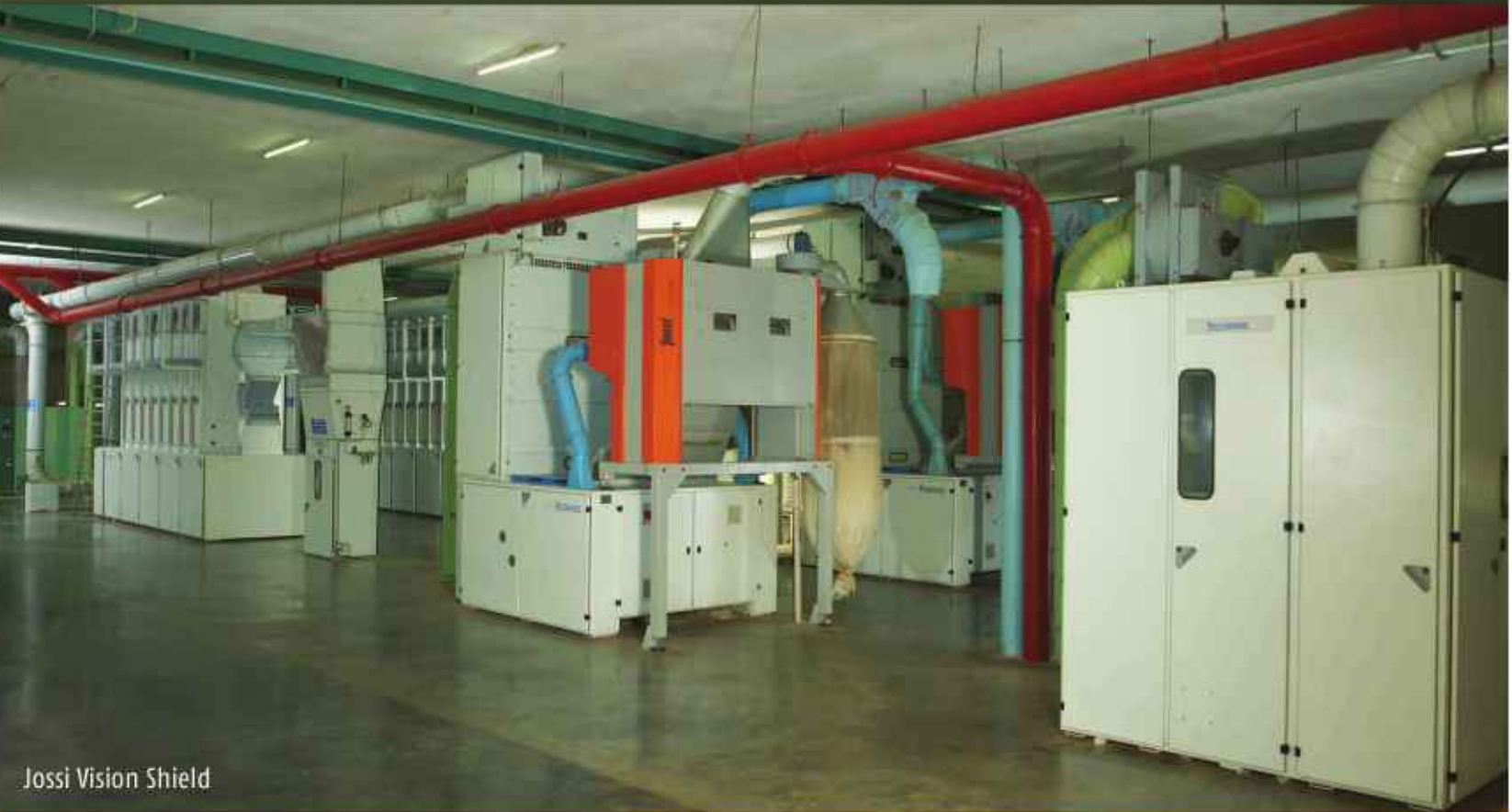
Jossi Vision Shield