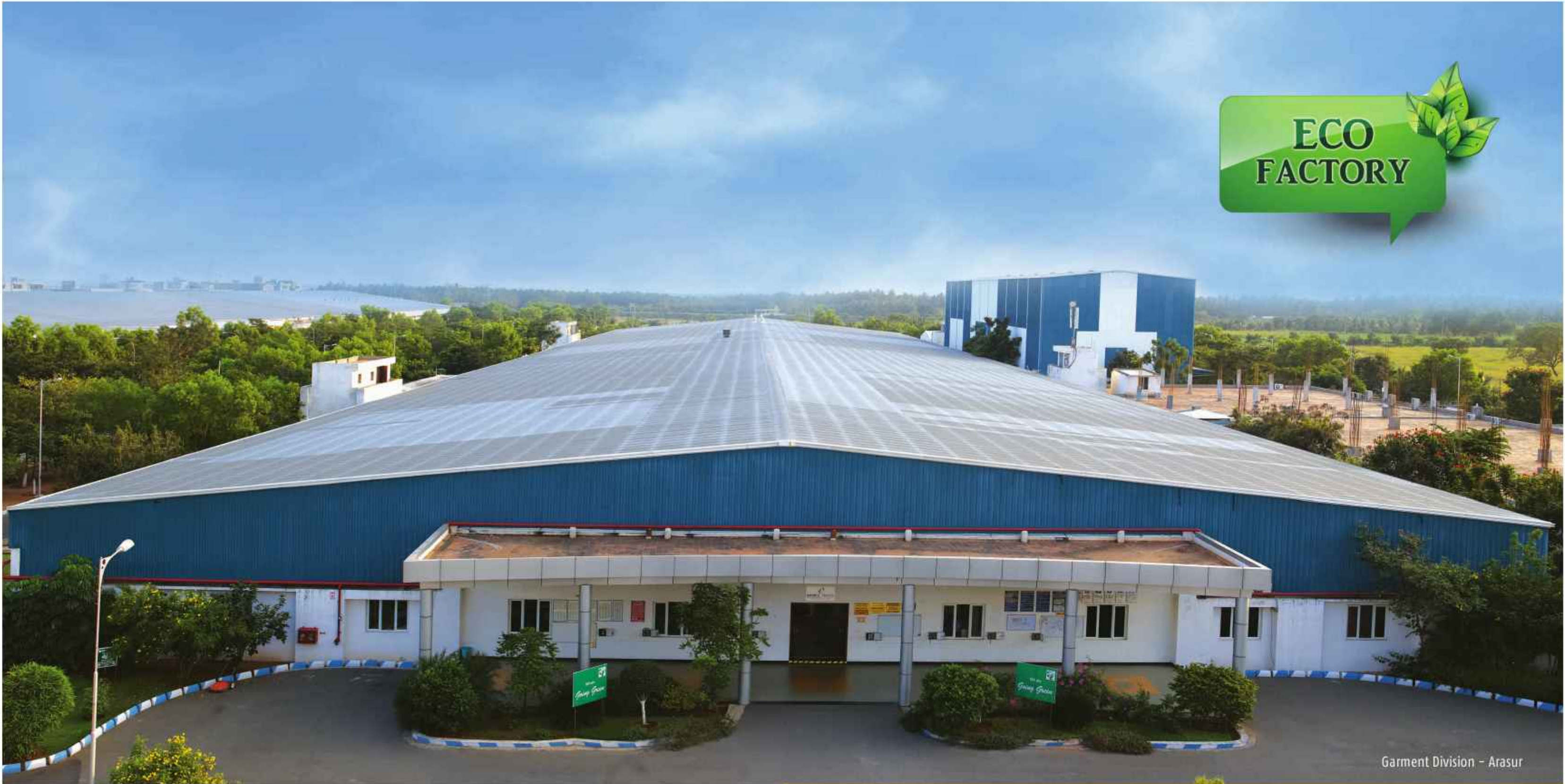
Garment Division - Arasur