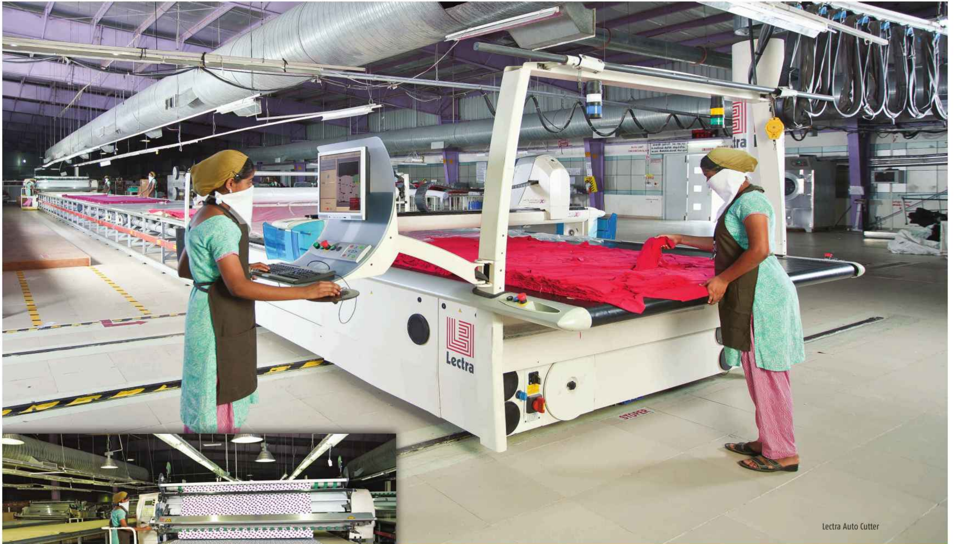
Lectra Auto Cutter