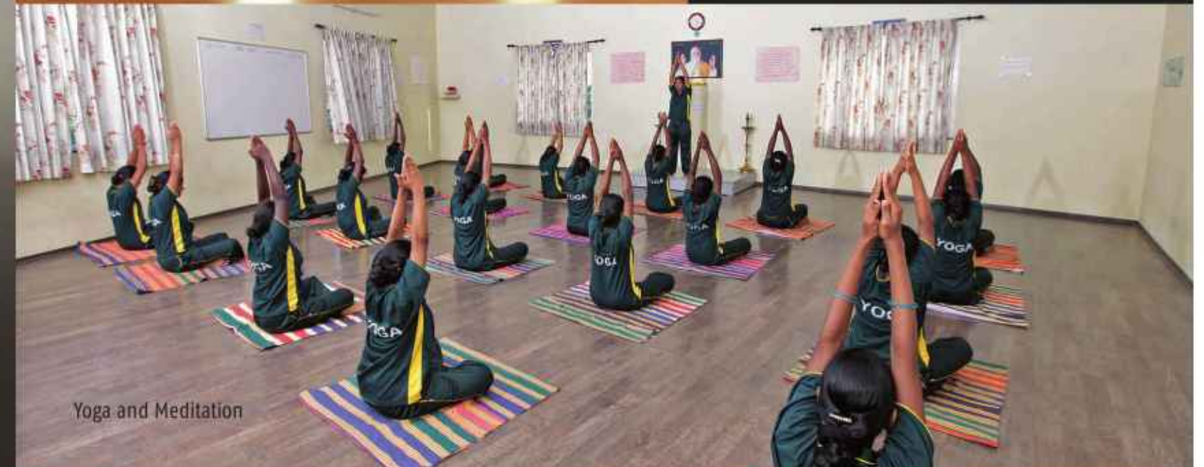
Yoga and Meditation