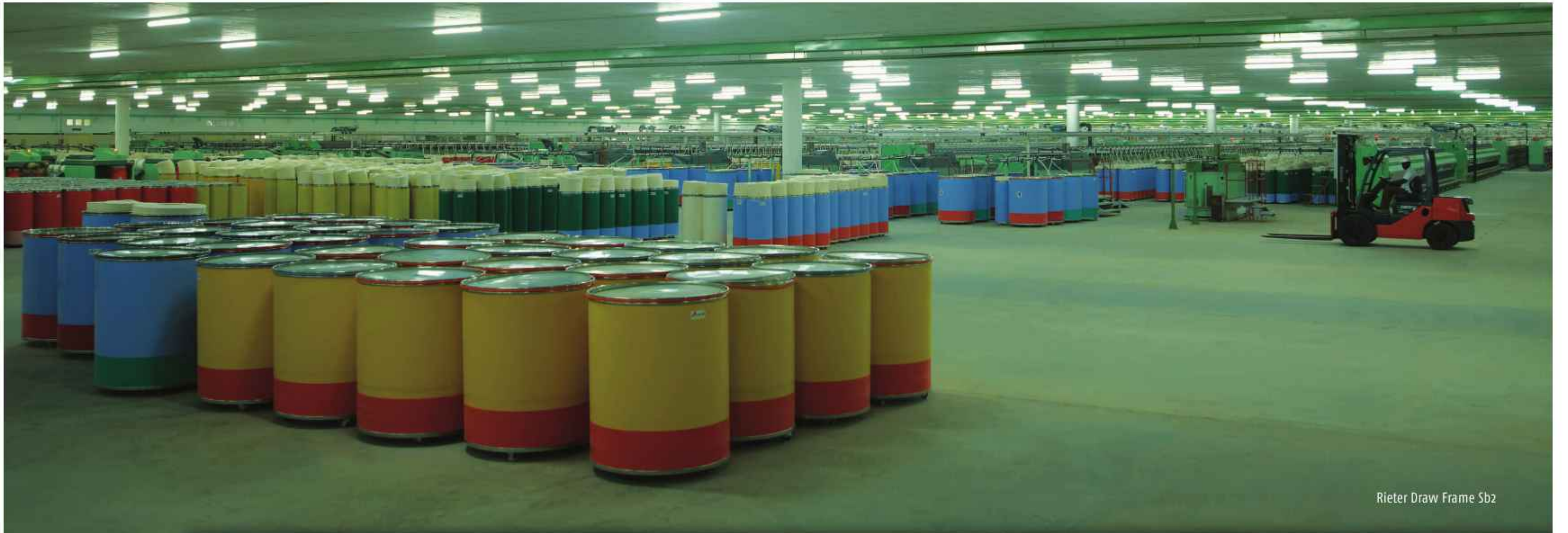
Rieter Draw Frame Sb2