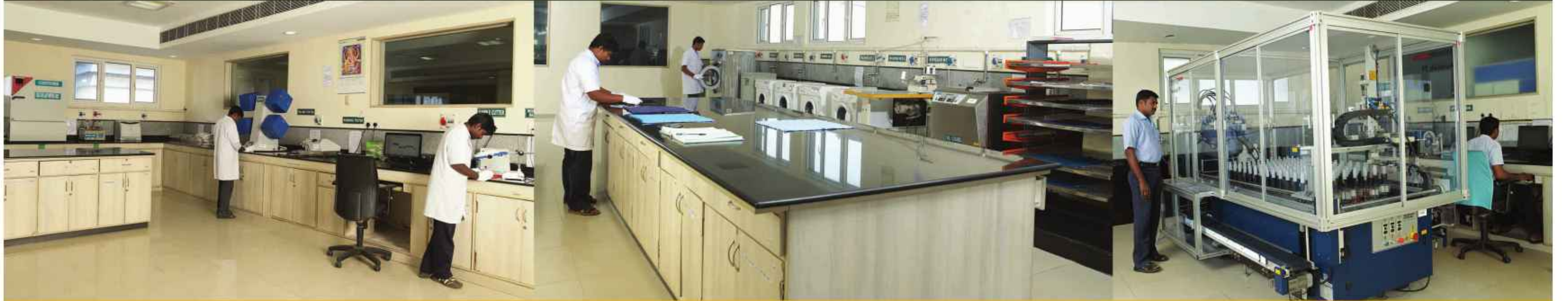
Orbitor Pilling tester from James H Heal, UK