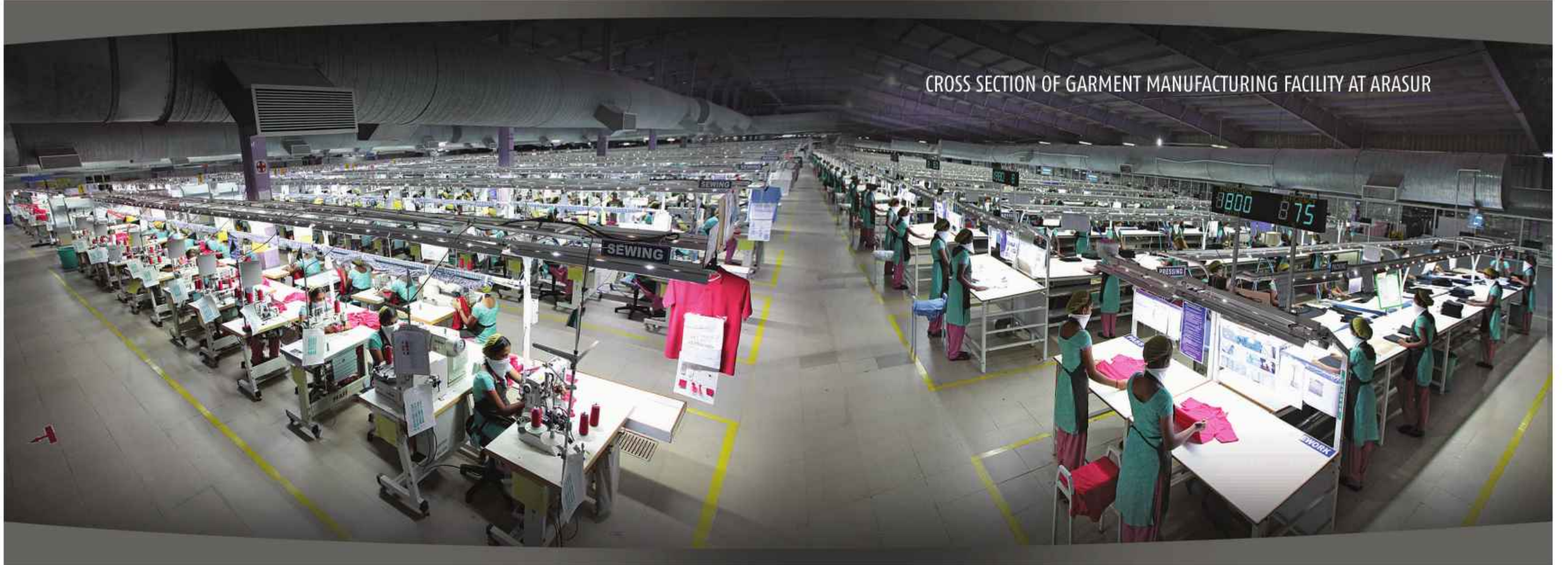
CROSS SECTION OF GARMENT MANUFACTURING FACILITY AT ARASUR