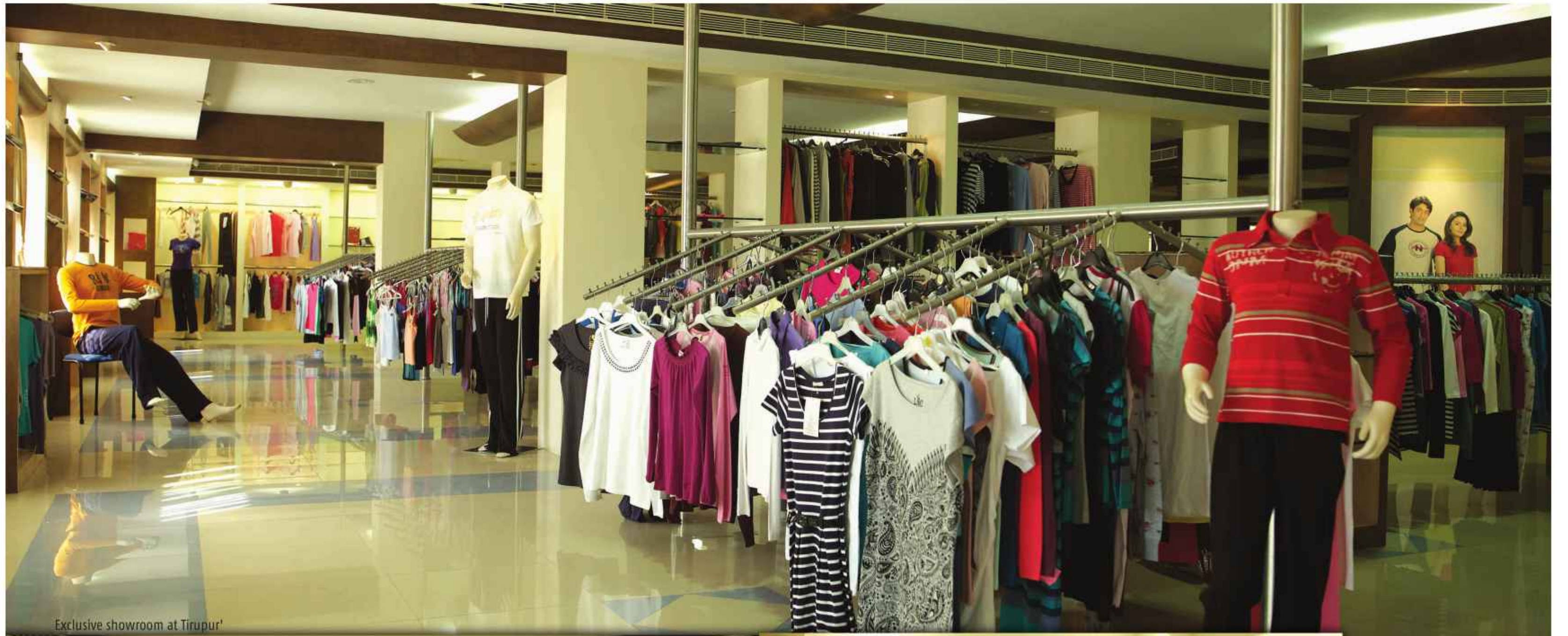
Exclusive showroom at Tirupur!