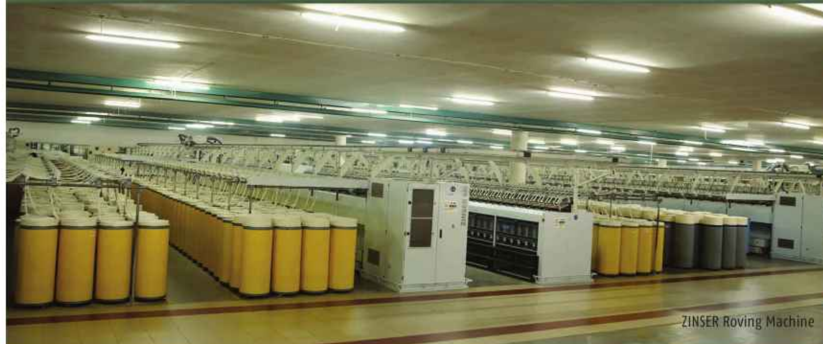
ZINSER Roving Machine