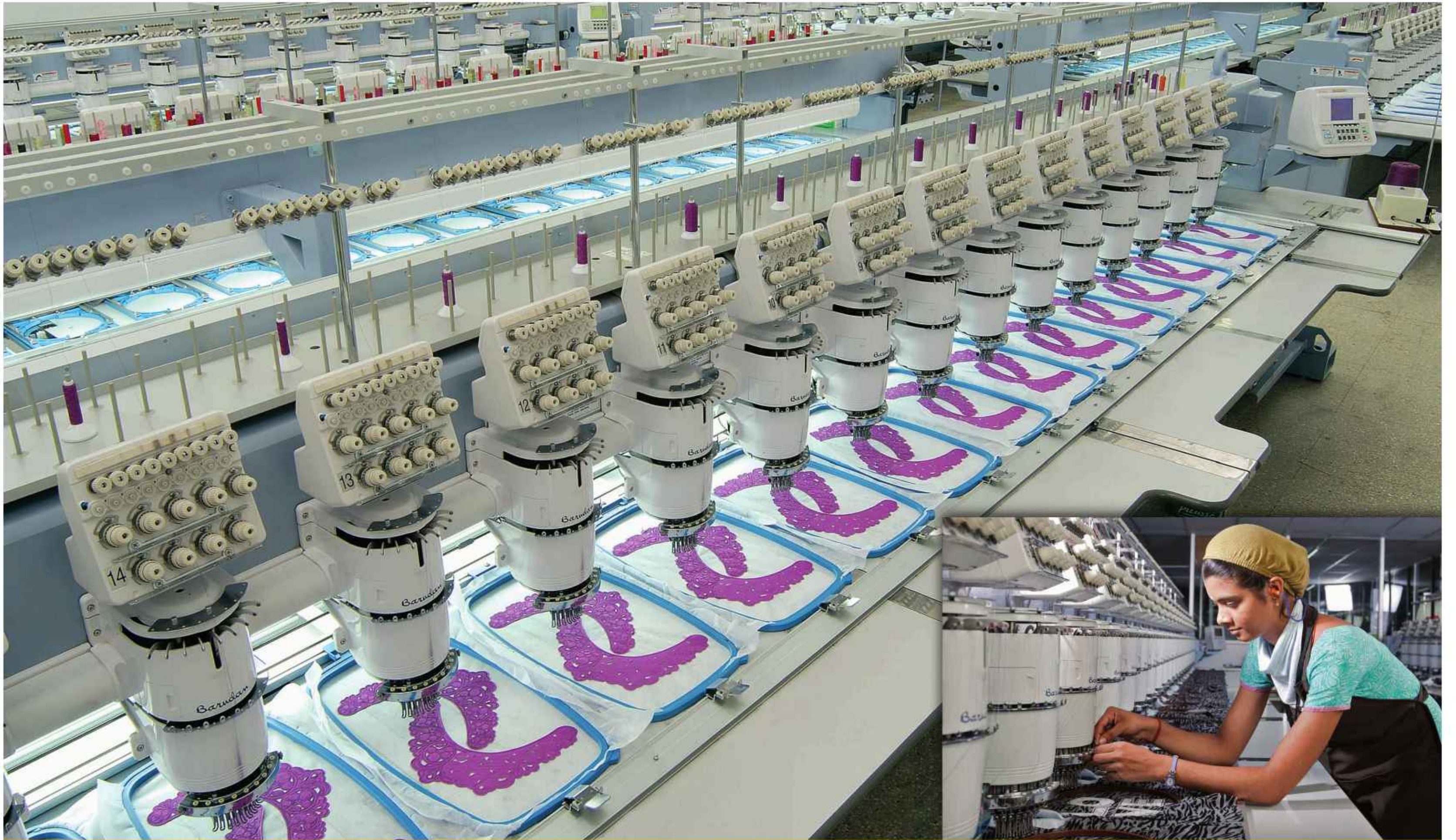
Computer Aided, Multi Head Embroidery Machine